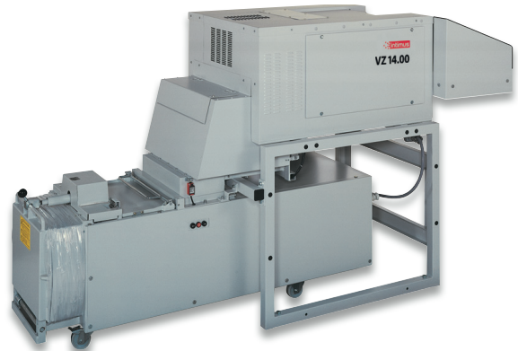
W/D/H 305/366 x 120 x 168 cm

For decades, the intimus® heavy duty shredders have proven to be centrally positioned pieces of equipment for the privacy-friendly disposal of disused media. The model range offers variations that can handle up to 550 sheets/h or even complete folders in a single operation. The spacious feed table with integrated infeed conveyor belt provides controlled, effortless, safe and fast loading. The shredded material is collected in large-scale, mobile or swing-out containers under the cutting mechanism. The shred-press combinations are coupled to a baler for immediate fully automatic compaction of the cut material into compact bales. Reduction effect compared to the loose collection of the cuttings is about 70%.